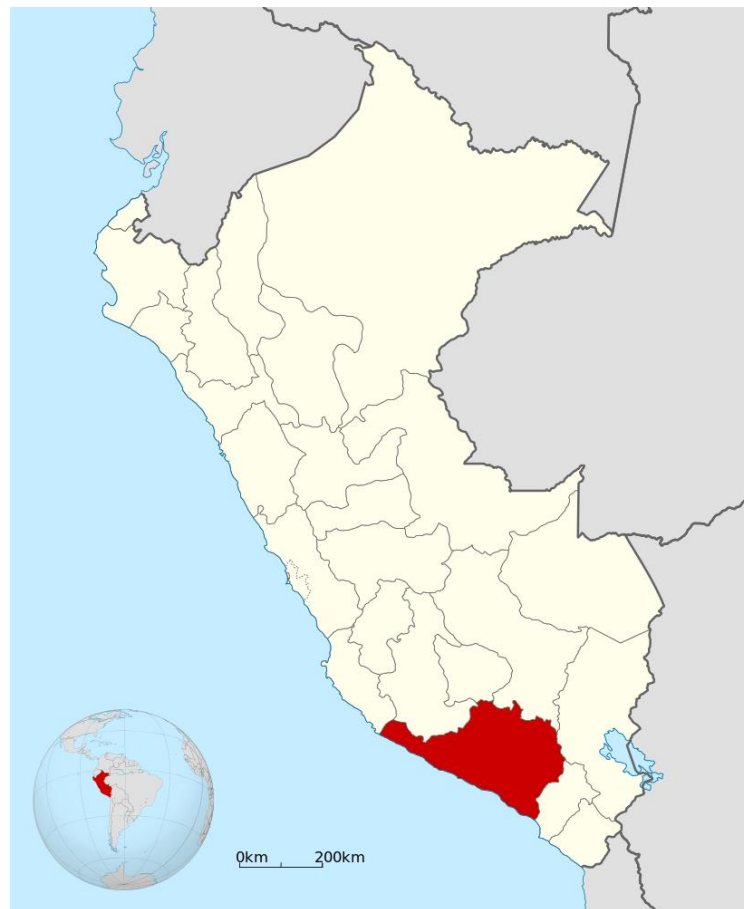
Figure 1. Location of Arequipa in Peru.

The Province of Arequipa is located in southern Peru, in the Arequipa Region (see Figure 1) and it is constituted by 29 districts, 19 of which are part of the metropolitan area of the capital of the province and greater city of the Arequipa Region (City of Arequipa). Following Law 23853, the Province of Arequipa is the administrative and political jurisdiction of the MPA (Instituto Municipal de Planeamiento, 2016).