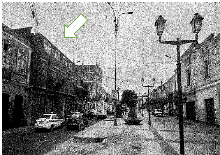
Picture 16. The new building (on the left) altered the monumental setting.

Following these inspections, the ministry opened an administrative proceeding against two individuals in order to investigate the alleged damage to cultural heritage. 207