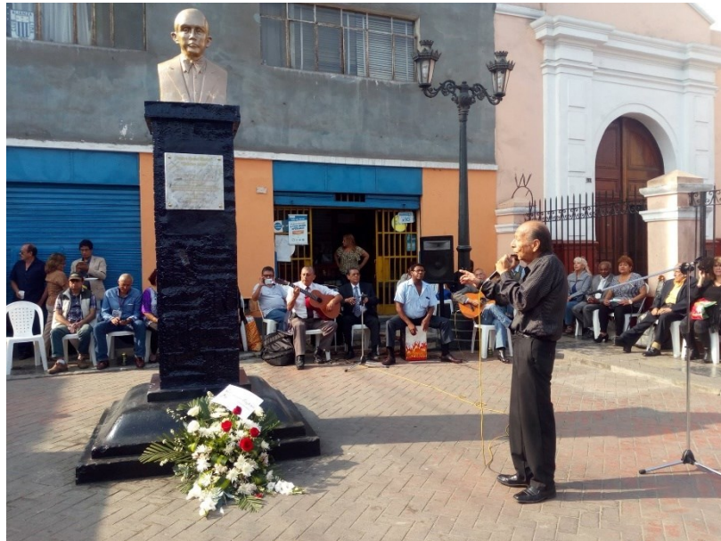
Picture 9. Neighbors paying tribute to Felipe Pinglo, songwriter of Peruvian Música Criolla, Barrios Altos. 2018.

As the way of life and social interactions of dwellers in Barrios Altos are shaped by the (un)certainly of tenure, 164 it is relevant to look at their property rights over traditional dwellings: residents of this sector are either owners, tenants (with recognition of their tenure rights), or occupants (with insecurity of tenure). 165 Most of the inhabitants fall into the latter situation. 166