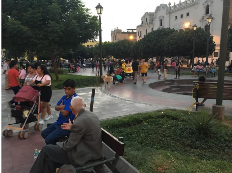
Picture 6. Italia square, Barrios Altos. 2019.