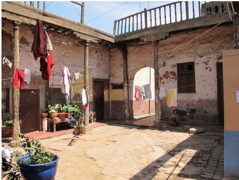
Picture 7. A quinta in Áncash street. 2011.

Some neighbors of Barrios Altos have been living in this urban area for more than twenty years. 161 Due to this connection with their dwellings, these persons can play a key role in the safeguarding and promotion of the traditional aspects of their neighborhoods. 162