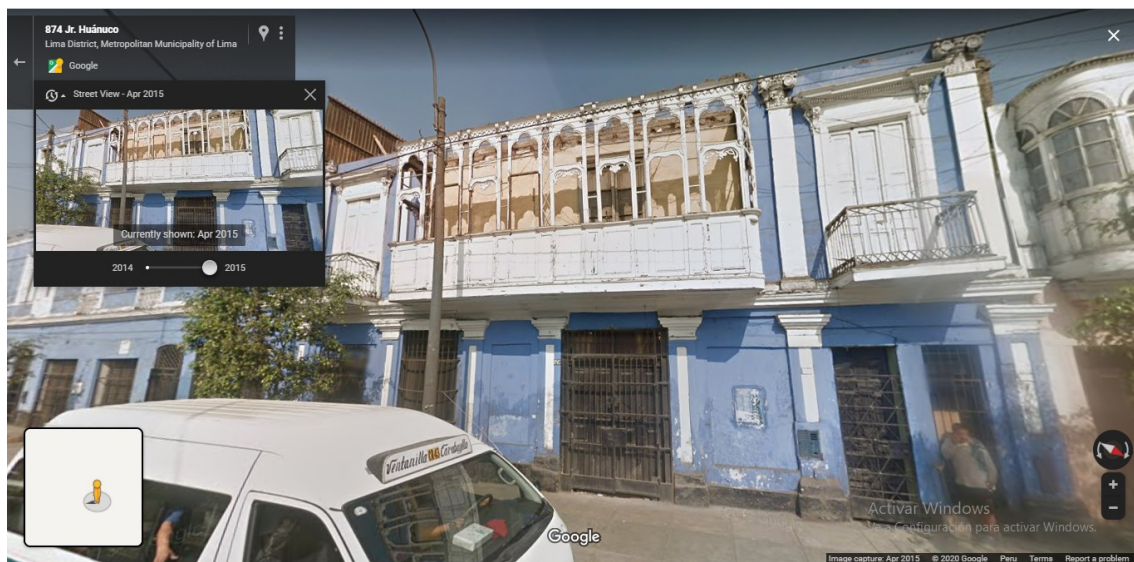
Picture 13. Historic building in April 2015.

On 27 April 2016 the Ministry of Culture conducted an ocular inspection in the building, which revealed that the property suffered a demolition compromising almost the totality of its second floor. 198 This demolition had not been authorized by the ministry. 199 On 29 April 2016 the ministry was informed by the municipality about that destruction. 200 The background also mentioned that in October 2016 the ministry ordered to the owner the adoption of emergency measures of preventive character, with the view to averting any damage to the property and to persons. 201 These emergency measures consisted in the relocation of a wall standing in the second floor for its safeguarding, and the roping off of the area surrounding the building to protect passers-by. 202 Said measures did not involve the suspension of works.