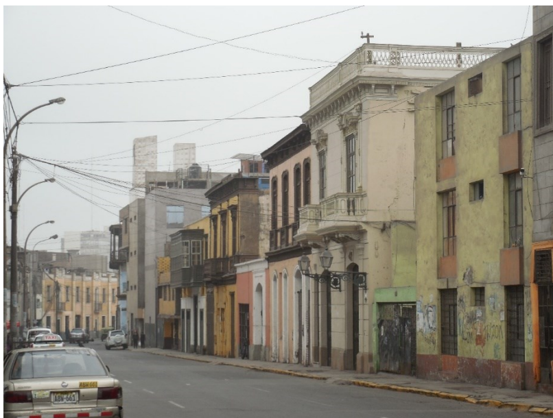
Picture 2. Historic buildings in Junín street, Barrios Altos. 2019.

Among the protection afforded to cultural heritage, the Peruvian legislation establishes that private ownership has limits and imply obligations on their titulares, based on the public interest and the need for its preservation: 131