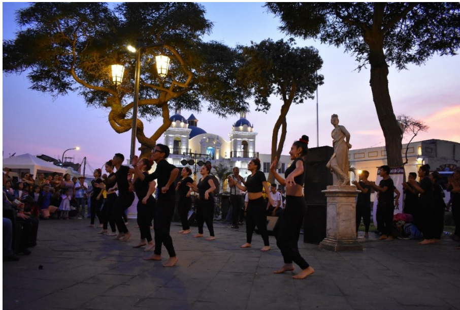
Picture 4 . Gastronomic event in Santo Cristo square, Barrios Altos. 2020.