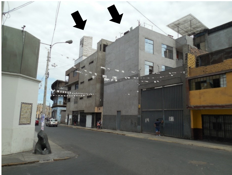
Picture 11. A truck carrying goods and merchandise for a warehouse in Barrios Altos. 2020.