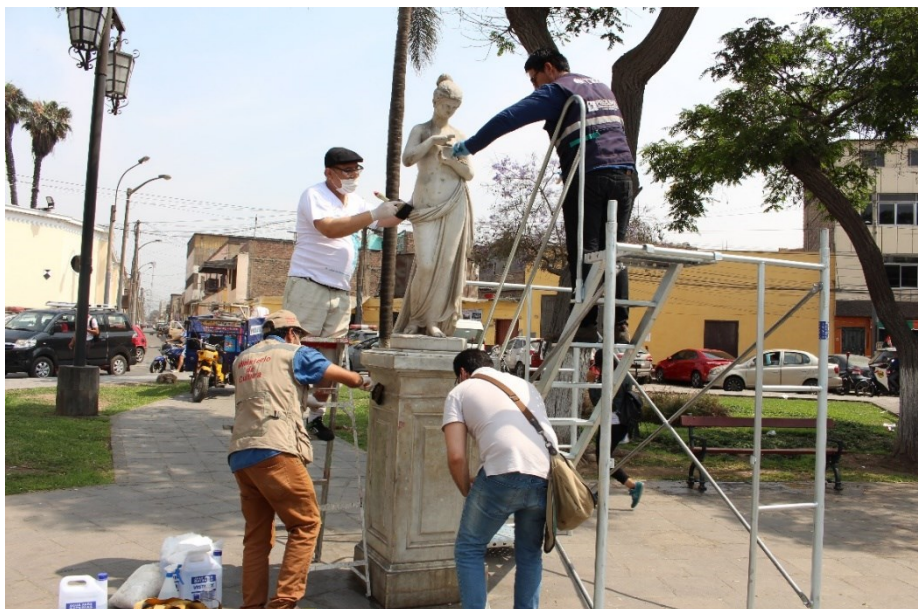
Picture 8. Neighbor participating in the cleaning of a sculpture in El Cercado square, Barrios Altos. 2019.

Some neighbors of Barrios Altos have been living in this urban area for more than twenty years. 161 Due to this connection with their dwellings, these persons can play a key role in the safeguarding and promotion of the traditional aspects of their neighborhoods. 162