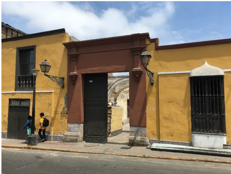
Picture 1. Historic buildings in Áncash street, Barrios Altos. 2019.

Certain cultural heritages of Barrios Altos are also protected by the inscription of the Historic Centre of Lima in the World Heritage List of UNESCO in 1991. 129 The area of this World Heritage Property covers some urban blocks and lots of Barrios Altos. 130