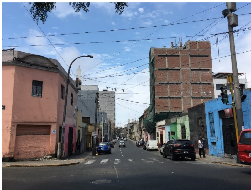
Picture 24. New building (on the right). December 2019.

It is inferred from state documents that, as offenders did not timely appeal this sanction to the Judiciary, this decision became final. 228 However, the offenders have not complied with the sanction, as the new building still stands.