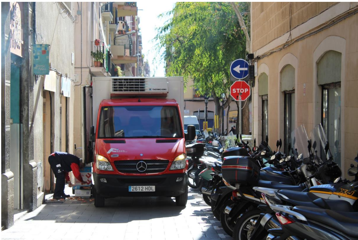
Figure 8 A box van and parked motorbikes obstructing the pass of pedestrians on a narrow street in Vila de Gràcia Square, Barcelona, Spain

Underground distribution services can also play an important role in gaining public spaces for pedestrians and raising the quality of public life. Many authors (Rönkä, Ritola and Rauhala, 1998; Rueda, 2007) emphasise the advantages of freeing the surface from logistic vehicles to gain room for public life. Nevertheless, Van Binsbergen and Bovy (2000: 124) observe that freeing the surface from vans and small lorries may attract traffic if any regulations are applied. Despite all these benefits and