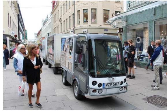
Figure 7 An electric road-train operating in Kungsgatan Street, Gothenburg, Sweden