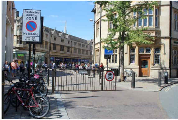
Figure 10 A fence limiting the entrance of logistics vehicles to the city centre, Cambridge, United Kingdom