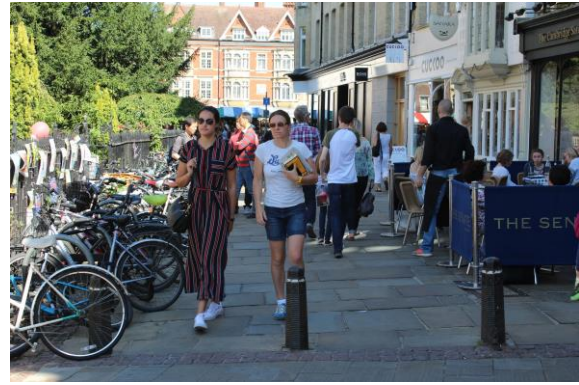
Figure 11 Bollards limiting the entrance of logistics vehicles to the city centre, Cambridge, United Kingdom