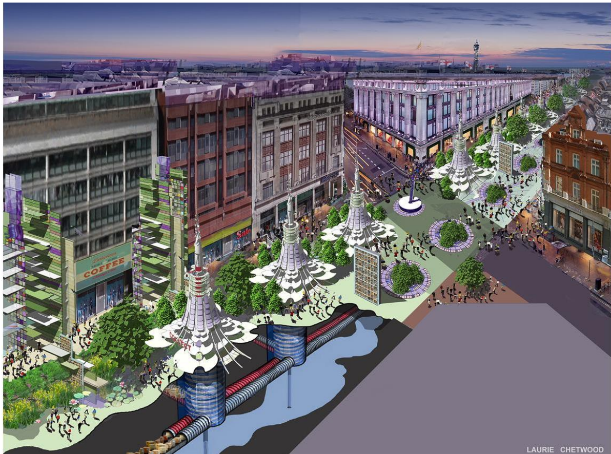
Figure 3 Well-Line project

buildings. For instance, the Well-Line project proposes the use of brownfield sites in London, as well as the creation of green spaces adjacent to the surface, along a six-mile underground goods distribution network (Münzner, 2016). The project also considers the development of residential units and manufacturing locations over the network, as well as warehouses located underground (see Figure 3).