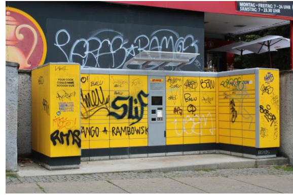
Figure 5 A DHL packstation located next to a market entrance in Berlin, Germany