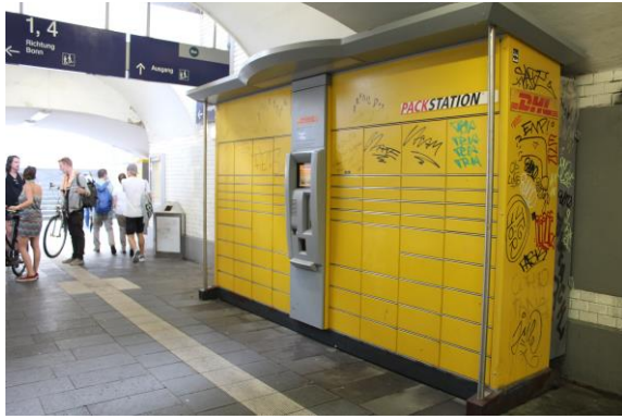
Figure 4 A DHL packstation located in a train station in Brühl, Germany