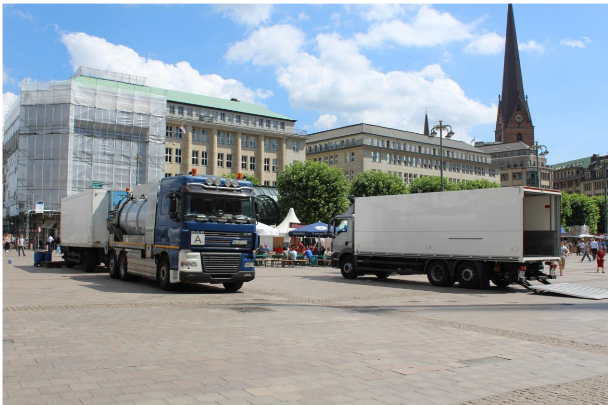
Figure 1 Two lorries unloading freight in Rathausmarkt square around the midday, when a significant number of pedestrians use the public space, Hamburg, Germany

Depending on its characteristics, city logistics has positive or negative effects on the economy, environment and society, both locally (the city) and globally (the planet). Several problems are originated on the use of lorries for urban distribution (Figure 1 shows one example). According to diverse authors (Van Duin, 1997; Goldman and Gorham, 2006; Monami, Kooijman and Duchâteau, 2008; Taniguchi and Thompson, 2008; Browne, Allen and Leonardi, 2011; Lenz and Riehle, 2013; Ballhorn, 2015; Savelsbergh and Van Woensel, 2016), some of these negative effects are traffic congestion, road collapses and damage to buildings, greenhouse gas and particulate matter emissions, noise pollution, accidents, reduced pedestrian safety, conflicts between street users, logistics sprawl, reduced quality of life, and aesthetic impact on city centres.