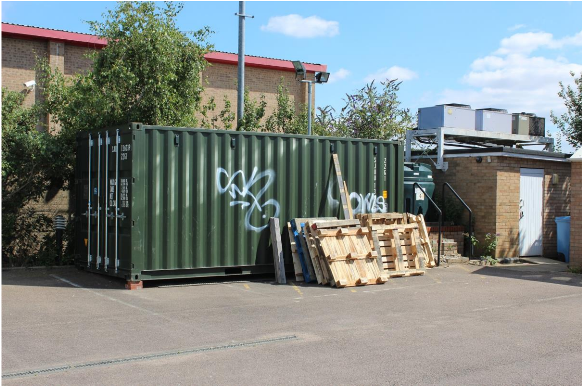
Figure 9 Outsspoken container in its new location within the company's depot, Cambridge, the United Kingdom