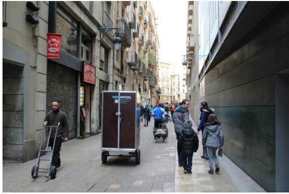
Figure 6 On the left, a man pushing a hand trolley; in the centre, a cargo tricycle on Sant Pau street, Barcelona, Spain